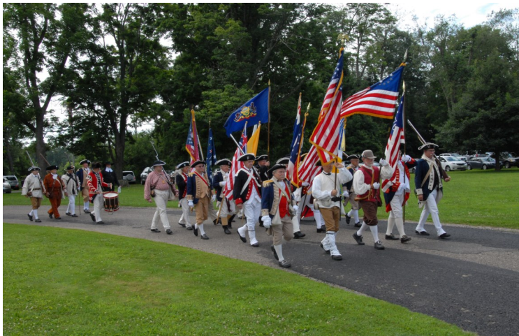
The Color Guard advances the colors.