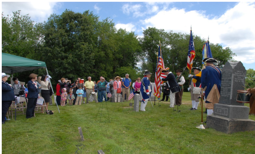
Left and above, a Grave Marking Ceremony in Suffield Twp., Portage County, OH. Held in late June, 2014.