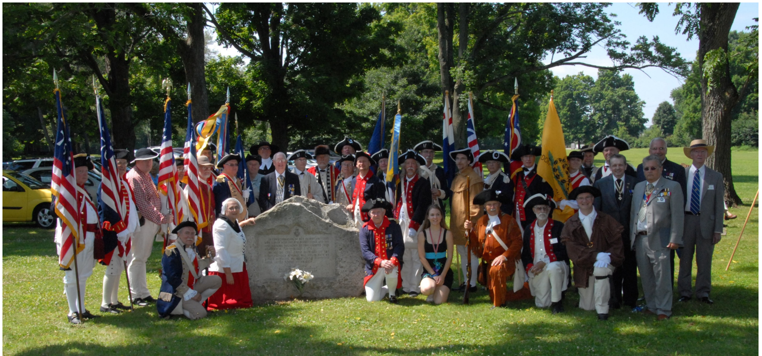
The combined state color guard at Fort Laurens Memorial in Bolivar, OH on July 26, 2014