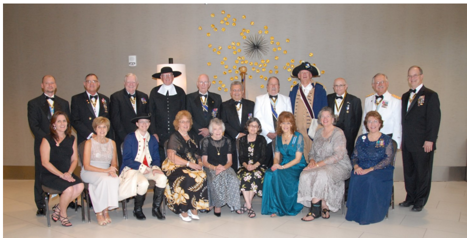
2014 OHSSAR National Congress attendees, their ladies and a few of their friends.