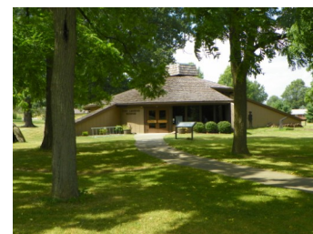
Fort Laurens Museum

The site was placed on the National Register of Historic Places in 1970. While nothing remains of