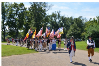
SAR Color Guard Advances The National Colors

On July 25th, 2015, the Ohio Society Sons of the American Revolution hosted its annual Fort Laurens Memorial Service at the site of this historic Revolutionary War fort in Bolivar, Tuscarawas County, Ohio. Members of the SAR, DAR, C.A.R. and other patriotic groups and organizations, migrate to this ceremony each year, and pay homage to the American soldiers who died in its siege in 1779. This year, SAR members came from Ohio, Indiana, Kentucky, West Virginia, Virginia, and Pennsylvania to participate in the ceremony, considered a national event in the National Society SAR organization. Perhaps a brief history lesson will explain why such importance is placed upon this historical site.