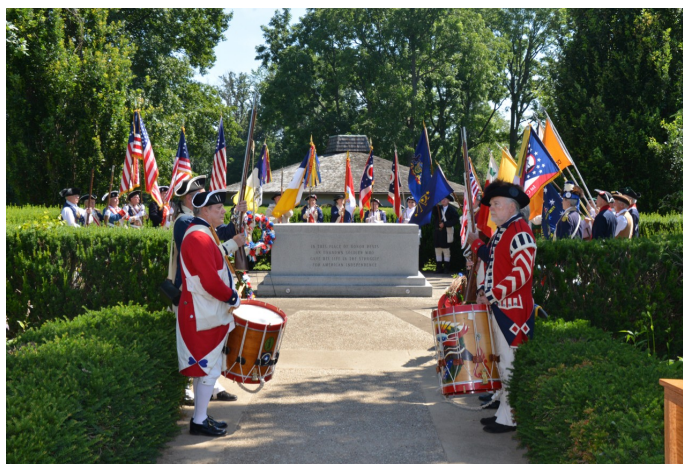
Tomb of the Unknown Patriot of the American Revolution

For more information on the work of the Friends of Fort Laurens Foundation, visit their website at www.friendsoffortlaurens.org .