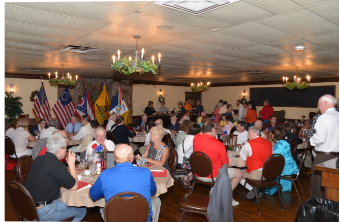
Saturday Luncheon at the Firehouse Grille & Pub in Zoar

Saturday, July 25th began with the Board of Management meeting at 8:00AM. Immediately following, our members proceeded to the Fort Laurens Historic Site a few miles away for a Memorial Service at 11:15AM. Then, it was back to the Firehouse Grille and Pub at 12:30PM for another outstanding buffet meal, concluding with the presentation of National Society and Ohio Society awards to chapters, members, and supporters of the SAR.