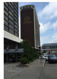
The Galt House Hotel