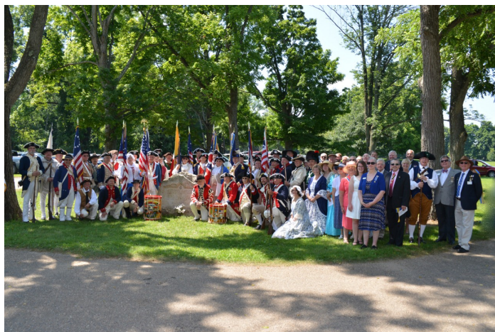
Participants Gather After This Year's Fort Laurens Ceremony

The British forces were also suffering the harsh conditions of that winter, and abandoned their siege on March 20th, 1779. Three days after the siege was lifted, American rein-