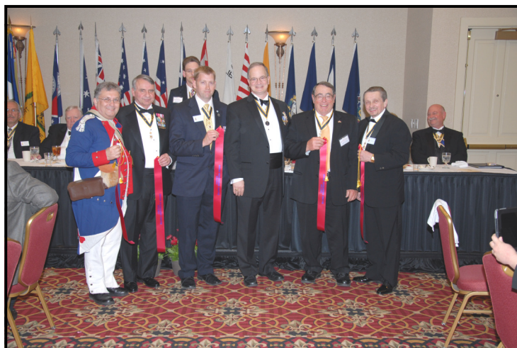
Winners of the Distinguished Chapter streamer were L-R: Camp Charlotte, Cincinnati, John Hancock, General Henry Knox and Western Reserve.